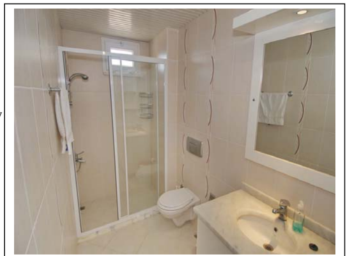
There are two bathrooms with shower in the apartment. Both bathrooms are covered with tiles