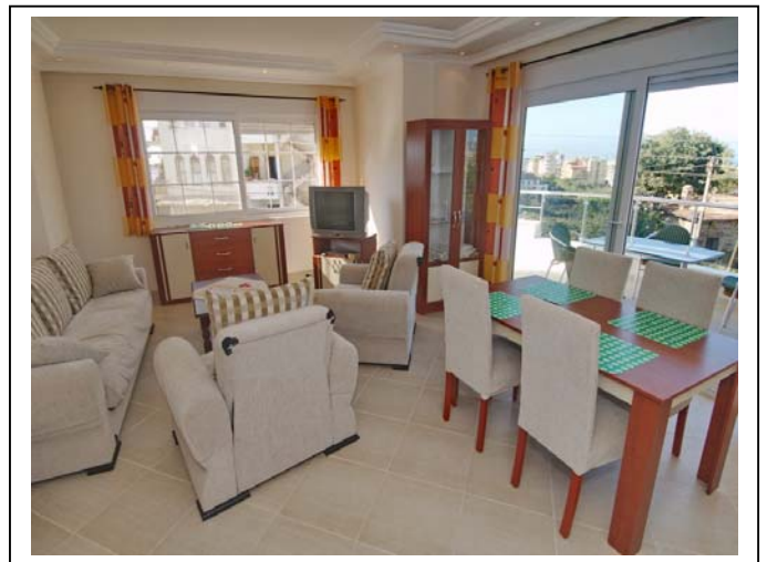
Living room with sofa, table and chairs. TV with satellite connection.