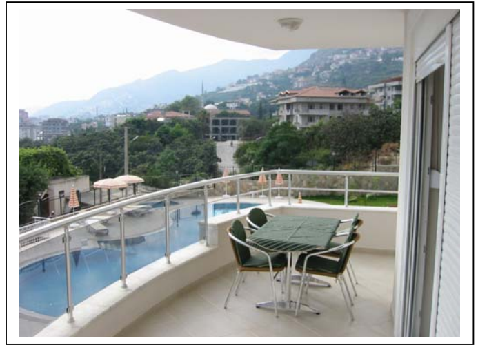
Main balcony outside living room. Good space for table, chairs and sun beds. Outdoor grill in the corner. Pool and town view.