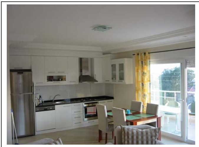
Open kitchen solution. Refrigerator with freeze, dishwasher and dining table with 6 chairs.